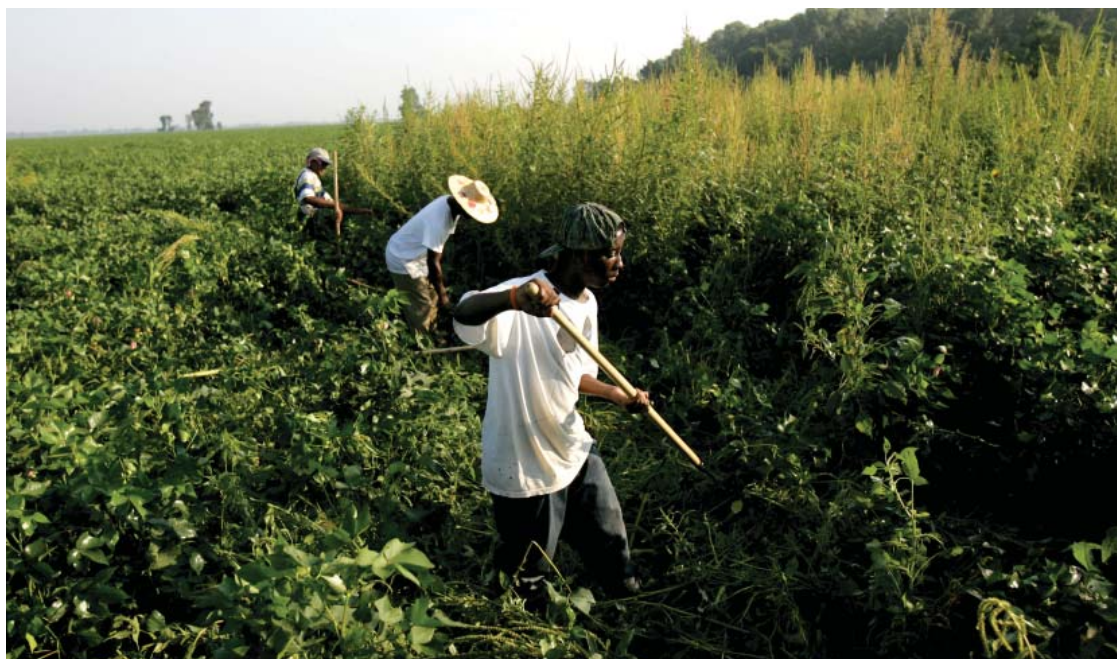
Farmers have resorted to hand weeding in an attempt to save cotton and soybean fields heavily infested with glyphosate-resistant Palmer amaranth.

Figure 1.1 shows the upward trend in the pounds of glyphosate applied per crop year 1 across the three HT crops. USDA NASS data show that since 1996, the glyphosate rate of application per