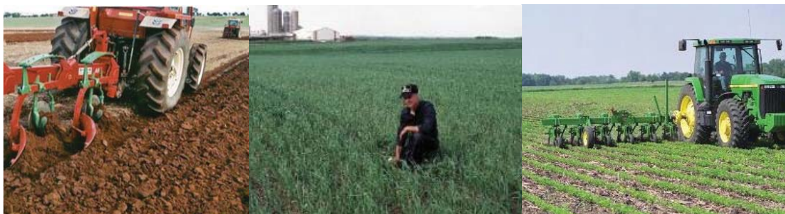
Farmers will have to diversify weed management tactics and systems to deal with HR weeds. Deep tillage (left photo) buries weed seeds; cover crops (center) can repress weed germination and growth; and mechanized cultivation between plant rows (right) is a proven alternative to herbicides.

cotton fields in 2003, about when experts predicted field resistance would emerge.