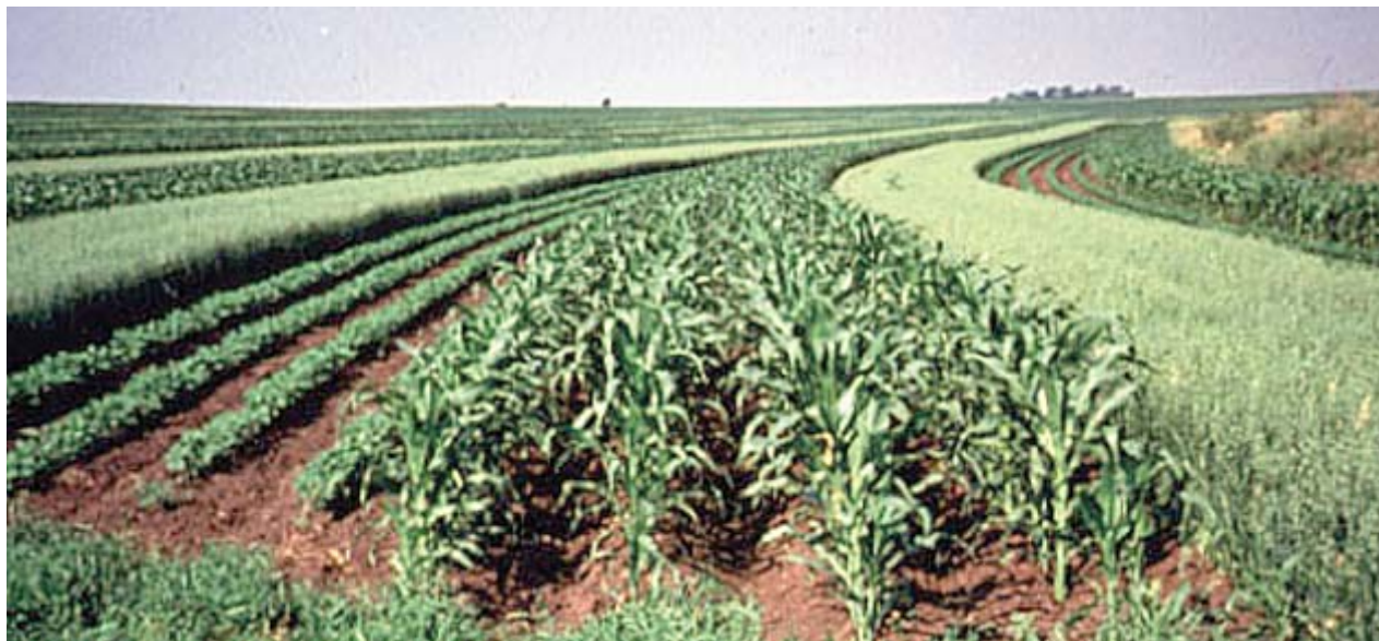
Corn and soybean strip-cropping systems reduce weed and insect pressure and lessen reliance on pesticides and GE crops