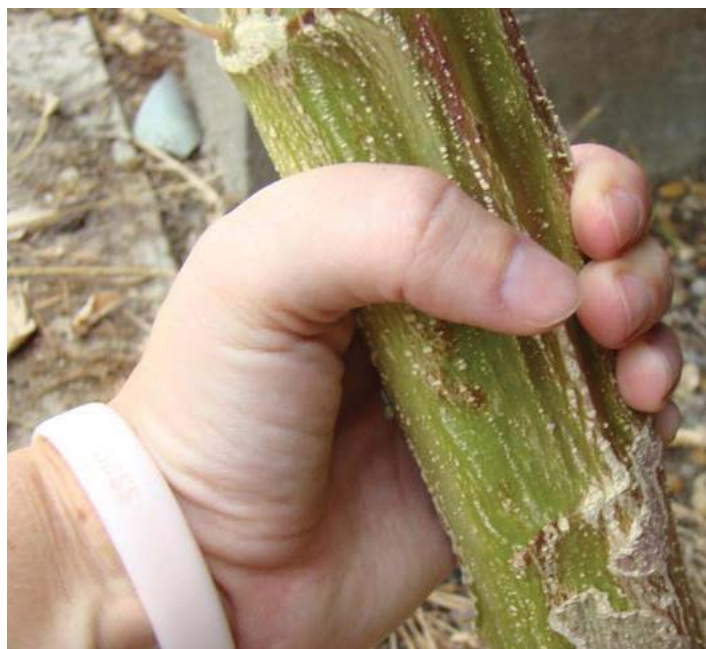
The stalk of a mature Palmer amaranth weed can reach six inches in diameter, and can damage mechanical cotton pickers.

The widespread adoption of glyphosate-resistant (GR), RR soybeans, corn, and cotton has vastly increased the use of glyphosate herbicide. Excessive reliance on glyphosate has spawned a growing epidemic of glyphosate-resistant weeds, just as overuse of antibiotics can trigger the proliferation of antibiotic-resistant bacteria.